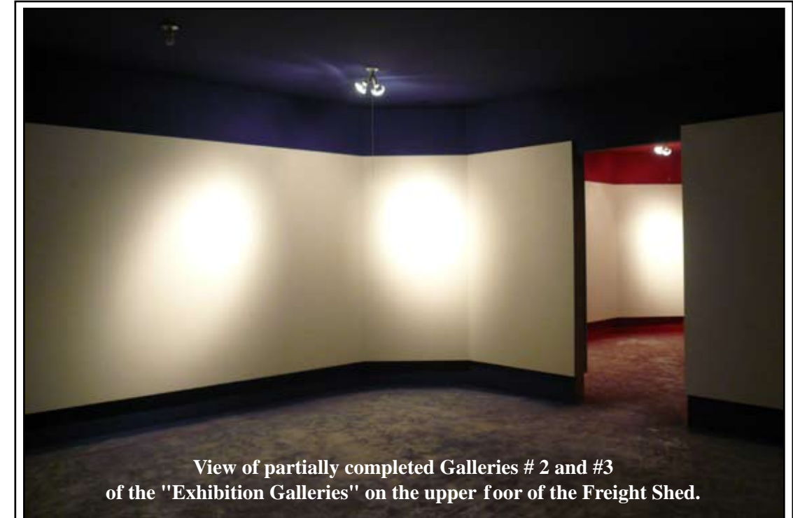
View of partially completed Galleries # 2 and #3 of the "Exhibition Galleries" on the upper floor of the Freight Shed.

SPRING/SUMMER/FALL: (Victoria Day Mid-May to Thanksgiving Mid-Oct.) Daily - 10am - 6pm * Railcar Tours all day.